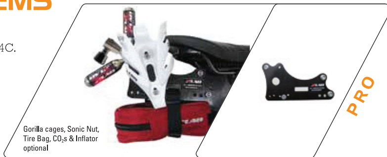
Gorilla cages, Sonic Nut, Tire Bag, CO 2 s & Inflator optional