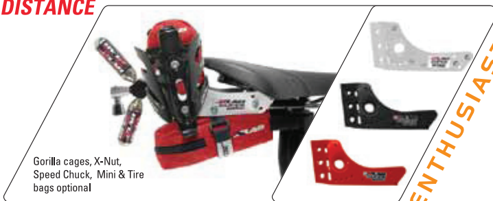
Gorilla cages, X-Nut, Speed Chuck, Mini & Tire bags optional