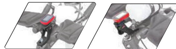
Mounted on Steerer cap behind aero bottle with straw

Zero drag from your computer once you install it on the rear of the Torpedo Mount or on steerer cap behind 'Aero' drink bottles with straws. Fits most computers. 22 mm diameter and straps up to 18.5 mm wide. Weighs only 21 grams.