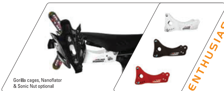
Gorilla cages, Nanoflator & Sonic Nut optional