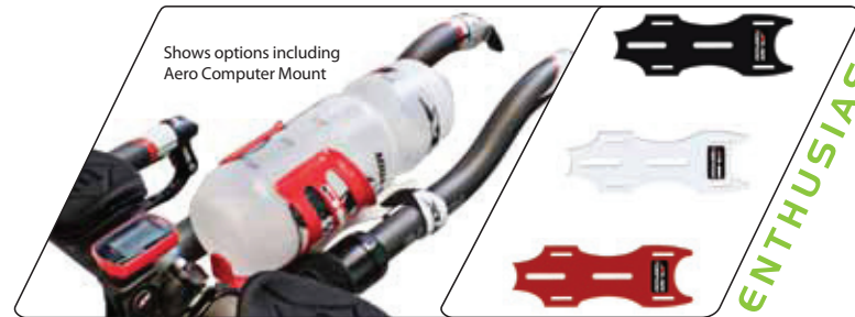
Shows options including Aero Computer Mount