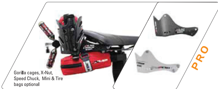
Gorilla cages, X-Nut, Speed Chuck, Mini & Tire bags optional