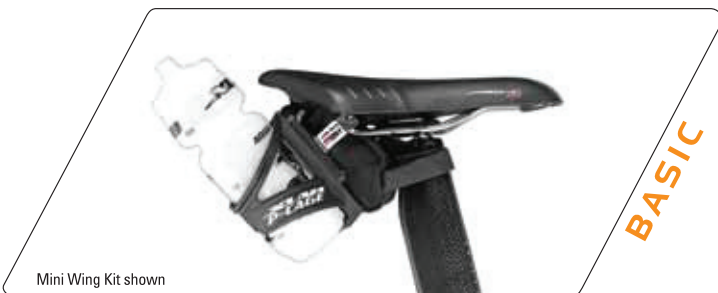
Mini Wing Kit shown

Weight: Mini Wing 233 grams including cages Mini Wing Kit 269 grams with cages and bag